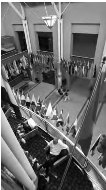
The Office of Admissions is located on the ground floor of the Ward Edwards Building in Suite 1400. The phone number is 877-SAY-UCMO (877-729-8266).

The Office of Admissions must receive all admission applications and supporting documents prior to the first day of class.