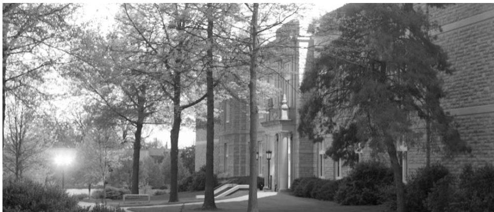
Photo: Many offices frequently visited by graduate students are located in the Ward Edwards Building on the north side of the quadrangle.

To call the University Operator, dial 660-543-4111.