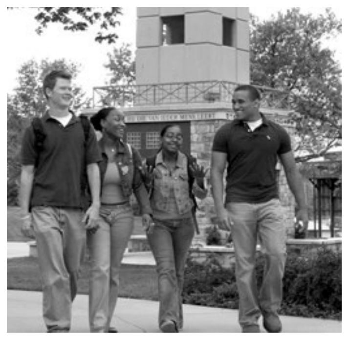
UCM enjoys a student population that is sixteen percent multicultural and seven percent international. Last year, students from 45 states and 64 foreign countries attended Central Missouri.

The University of Central Missouri actively follows a policy of nondiscrimination with regard to age, race, color, religion, sex, national origin, sexual orientation, marital status, Vietnam Era veterans, and persons with handicaps and disabilities.