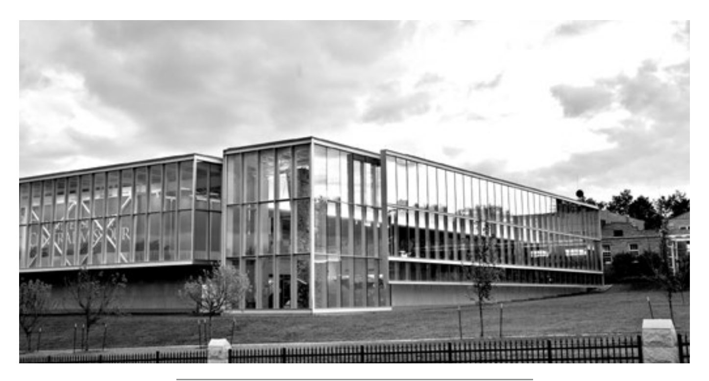
UNIVERSITY OF CENTRAL MISSOURI 2015 UNDERGRADUATE CATALOG

The University of Central Missouri has created an advising system designed to meet the needs of all students. The Gateway Advising and Major Exploration Center serves all Open Option students. Students pursing the General Studies major, as well as non-degree-seeking students (includes visiting high school and college students), and Aviation students at Whiteman Air Force Base are served by the Office of Extended Studies. Conditionally