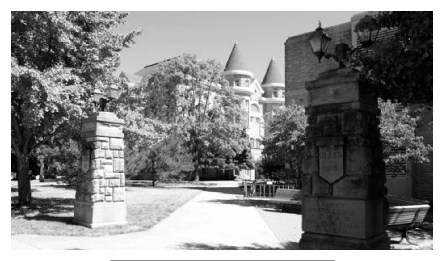
University of Central Missouri 2015 Undergraduate Catalog

Federal law requires institutions of higher education, including the University of Central Missouri, to inform prospective students, faculty and staff of institutional and financial information. This information is available at ucmo.edu/provost/info.cfm .