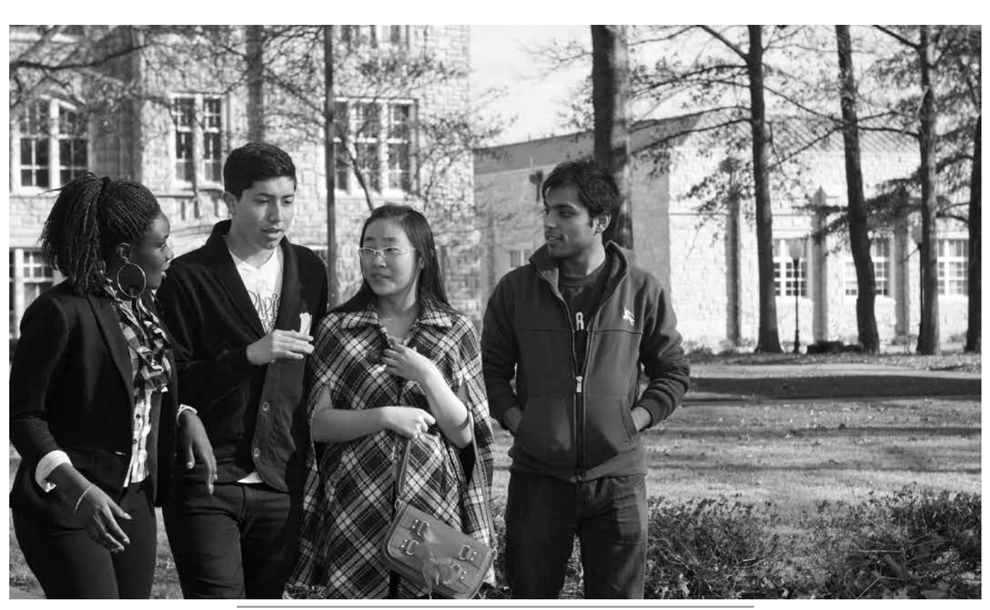
University of Central Missouri 2016 Undergraduate Catalog

Financial Aid. All international applicants are automatically considered for financial aid awards. The value of individual awards varies and is dependent upon academic merit and available funding levels. All awards are made at the time of admission to UCM. Please note that international students do not typically qualify for US-based federal or state financial assistance unless designated as an eligible non-citizen or a permanent resident by the U.S. Citizenship and Immigration Services (USCIS) of the Department of Homeland Security (DHS). Documentation verifying the student's citizenship status may be required by the UCM Office of Student Financial Services to determine the student's eligibility of financial aid. Students admitted to UCM are eligible for scholarship consideration and/or continuation based upon meeting minimum criteria established by UCM's Office of Student Financial Services. More information regarding scholarships available online at ucmo.edu/scholarships.