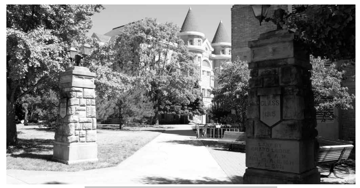
UNIVERSITY OF CENTRAL MISSOURI 2016 UNDERGRADUATE CATALOG

Federal law requires institutions of higher education, including the University of Central Missouri, to inform prospective students, faculty and staff of institutional and financial information. This information is available at ucmo.edu/provost/info.cfm .