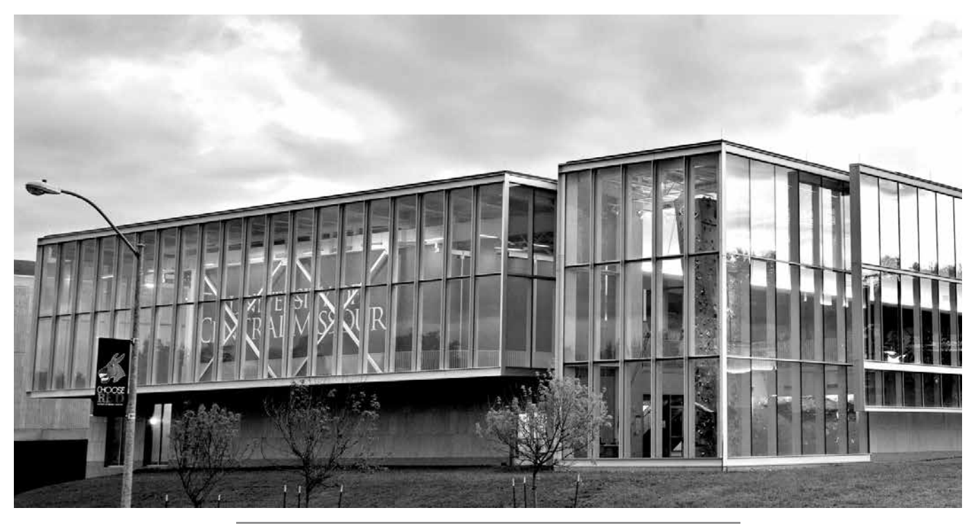
University of Central Missouri 2016 Undergraduate Catalog

Located in the Elliott Student Union, the Union Bowling Center (UBC) is a recently updated 10-lane facility. The UBC hosts many campus and off-campus groups and is home to the Jennies Bowling Team and the Men's Bowling Club. The center is open daily, approximately 360 days of the year. Special event reservations are welcome and more information is available by calling 660-543-4375. The UBC also rents inflatable games and casino equipment to interested student organizations. Steak and Shake® is located here and is open from breakfast through late night snack time.